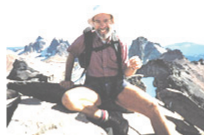
At my maximum, I weighed about 250 pounds more than shown here on a hike I could not have done before the weight loss!