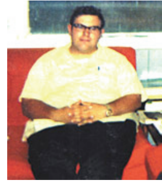
Me at 260 pounds — my high school graduation picture. Top weight 400 pounds.

#6: Get help. Counseling and support groups have been invaluable. I tried to fix the “unfixable family, friends, and workplaces.” This proved to be quite frustrating, unproductive, and self-destructive. I didn't have any role