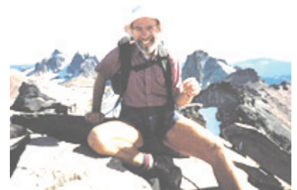
At my maximum, I weighed about 250 pounds more than shown here on a hike I could not have done before the weight loss!